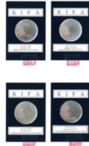
KIFA(KOREA FAR INFRARED ASSOCIATION) Certified 99.9% of pure eatable gold power