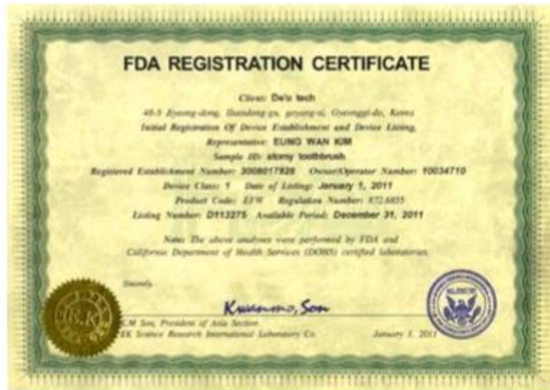
FDA Medical Device